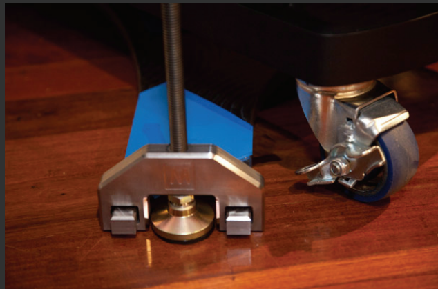
plate. Position the plate beneath the loud-speaker as shown below. Make certain that the front extensions do not impede upon the embossed circular reliefs that the casters are seated in.